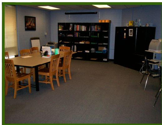
THE CAREER EDUCATION CENTER

Thanks to the William G. McGowan Charitable Fund, our Des Plaines campus was fortunate enough to develop a new, state-of-the art Career Education Center (C.E.C.). Students close to graduation have the opportunity to work on college applications while students of any age can get advice on applying for a part-time job. This room consists of several new computers, "Cable in the Classroom", and a