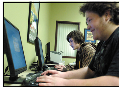
STUDENTS WORKING IN THE NEW COMPUTER LAB AT OUR DES PLAINES CAMPUS